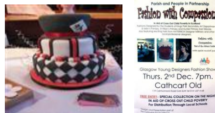
Fashion with Compassion and Mad Hatter's Tea Party

Check out our website (News pages or Gallery pages) for stories and lots of photos about the following: