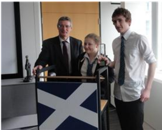
They talked their way to Brussels!