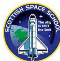
Scottish Space School