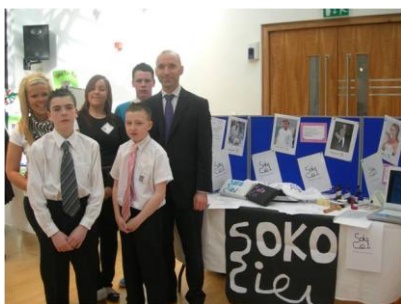
International Job Centre