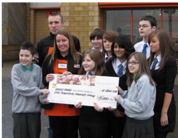
King's Park won a national award – the B&Q One Planet Living Award

Check out our website (News pages or Gallery pages) for stories and lots of photos about the following: