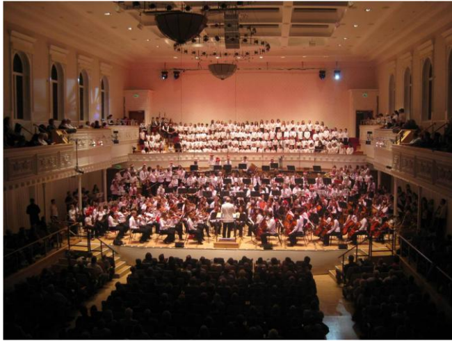
Seventeen King's Park pupils and two former pupils took part in the Glasgow School Christmas Concert in the City Halls in December