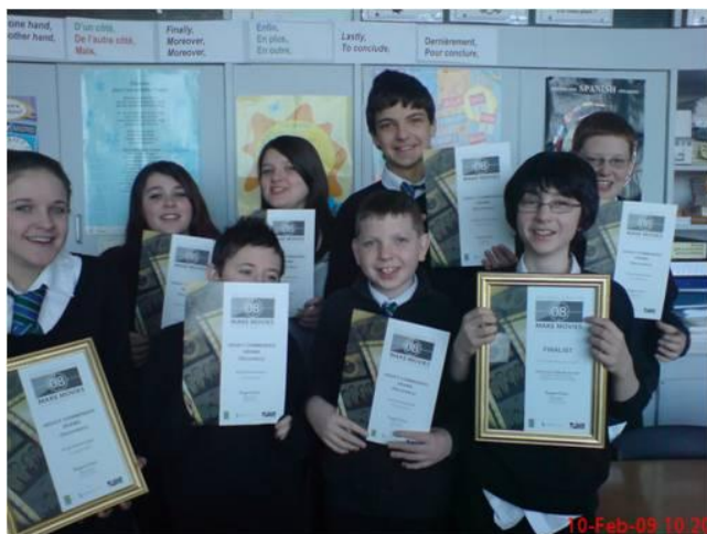
S2 pupils from King's Park Awarded 'HIGHLY COMMENDED' in the Determined to Make Movies competition.

Dear Parents, Carers and Friends of King's Park