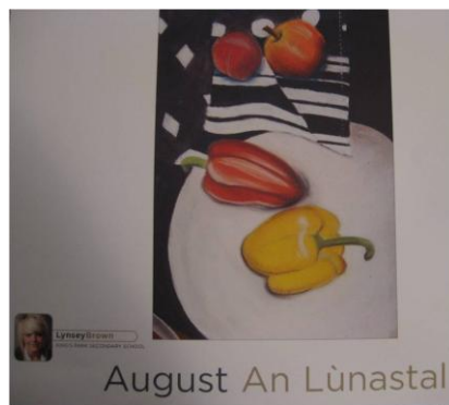
August An Lùnastal