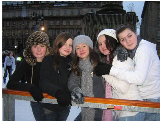
S1 Geography Trip