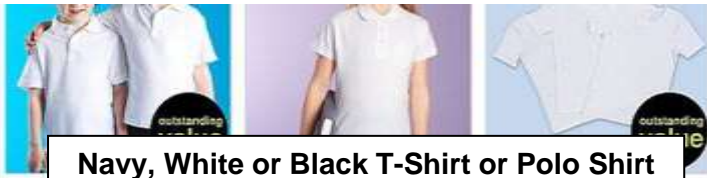
Navy, White or Black T-Shirt or Polo Shirt