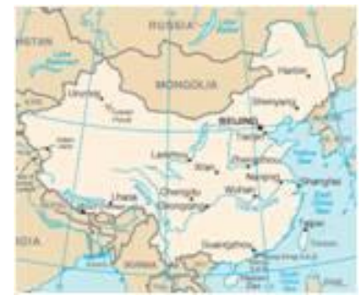
Chinese Immersion Course