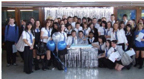
We say Good Bye to the class of 2009