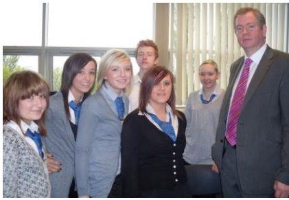
Higher Modern Studies class meet Tom Harris, MP