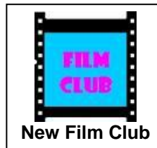
New Film Club