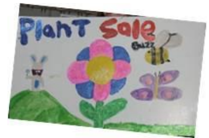
Thank you to everyone – we raised £800!