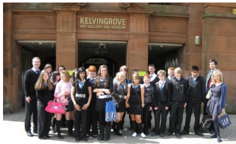
Visit to Kelvingrove – French Art