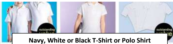
Navy, White or Black T-Shirt or Polo Shirt