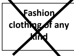
Fashion clothing of any kind