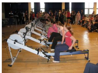
GLASGOW INDOOR ROWING COMPETITION

Check out our website (News pages or Gallery pages) for stories and lots of photos about the following: