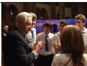
KING'S PARK PUPILS ON BBC'S QUESTION TIME