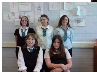
CREATIVE WRITING GROUP

School reopens on Monday 5 January 2009. We expect all pupils to arrive very smartly dressed in full school uniform, ready to start the new term.