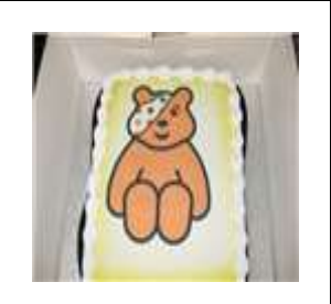
Children in Need