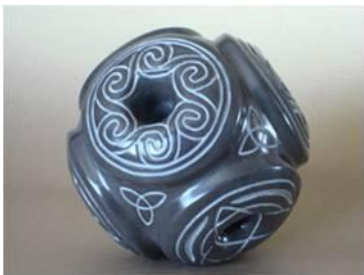
The Sconestone came to King's Park. Read all about it on the website.